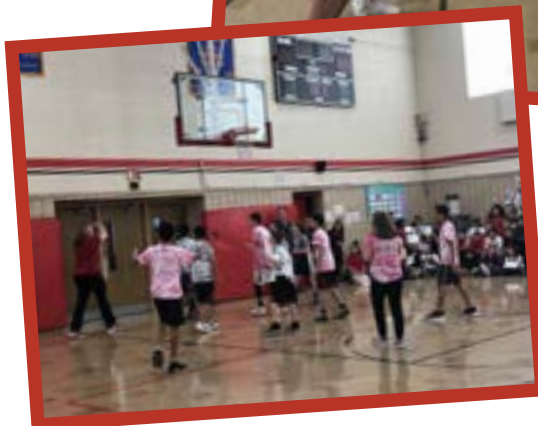
Seventh-graders took on the eighth-graders in an exciting basketball game at JPIIA. This is a time-honored Catholic Schools Week tradition for this school.