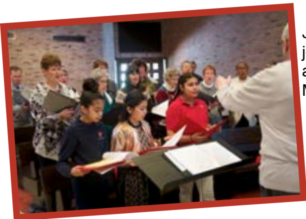
JPIIA students joined the adult choir at Mass.