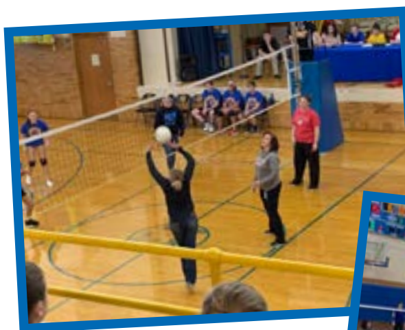
St. Joseph's eighth-graders beat the teachers in a volleyball game, 15-12!