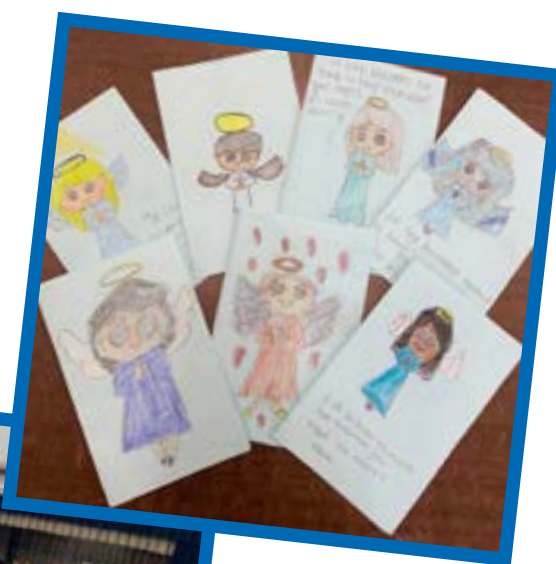
St. Joseph students made angel cards for blessing baskets. The cards and baskets will be given to those in need.